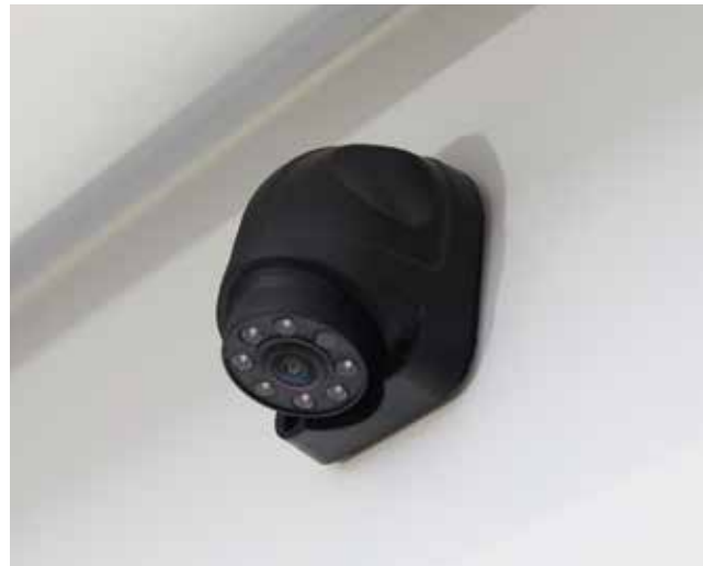
There are no blind spots when towing and parking – a world first in a production RV.