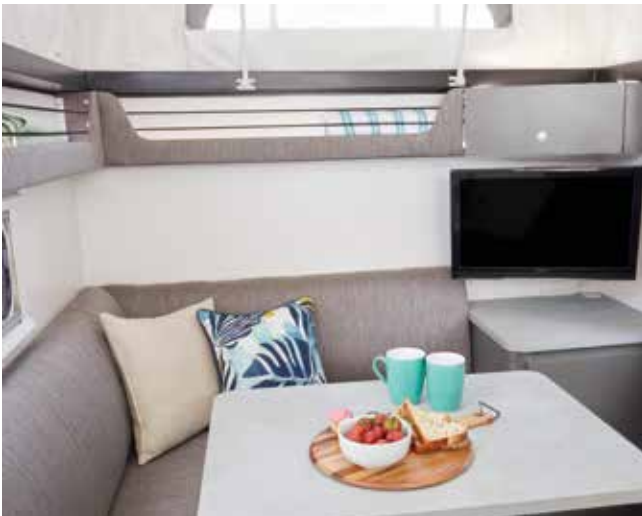
Everything is taken care of, with clever storage solutions, generously spaced lounge, double glazed push windows and 12V LED strip lighting.