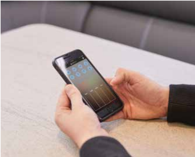
Exclusive to Jayco, JHUB phone app provides complete transparency of your RV's onboard features.