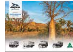
Jayco Sport & Adventure