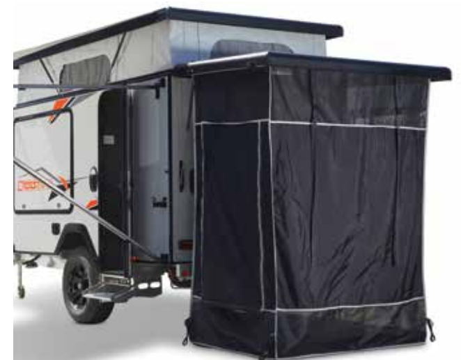
The rear hatch opens upwards to reveal the outdoor ensuite, complete with drop-down privacy tent and shower, with the option for a portable toilet.