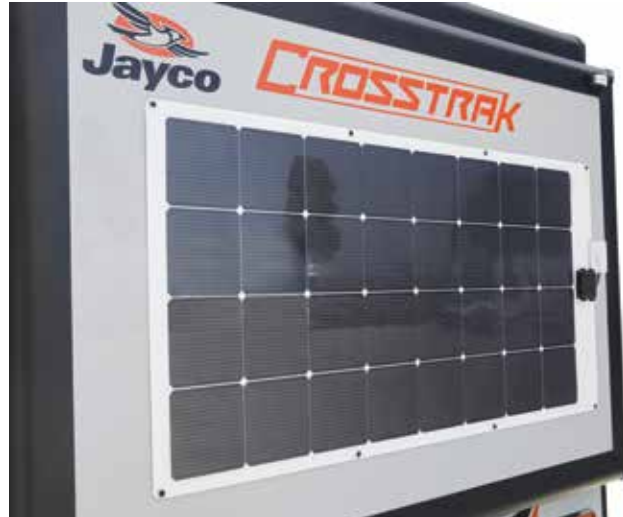
On top the rear hatch is a 150W flexi solar panel for charging your 100AMP deep cycle battery.