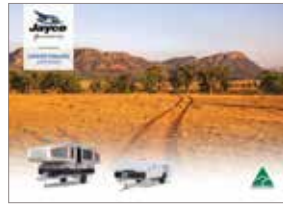
Jayco Camper Trailers