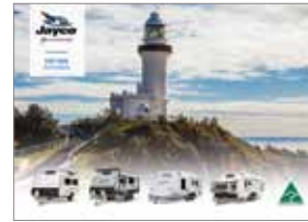
Jayco Pop Tops